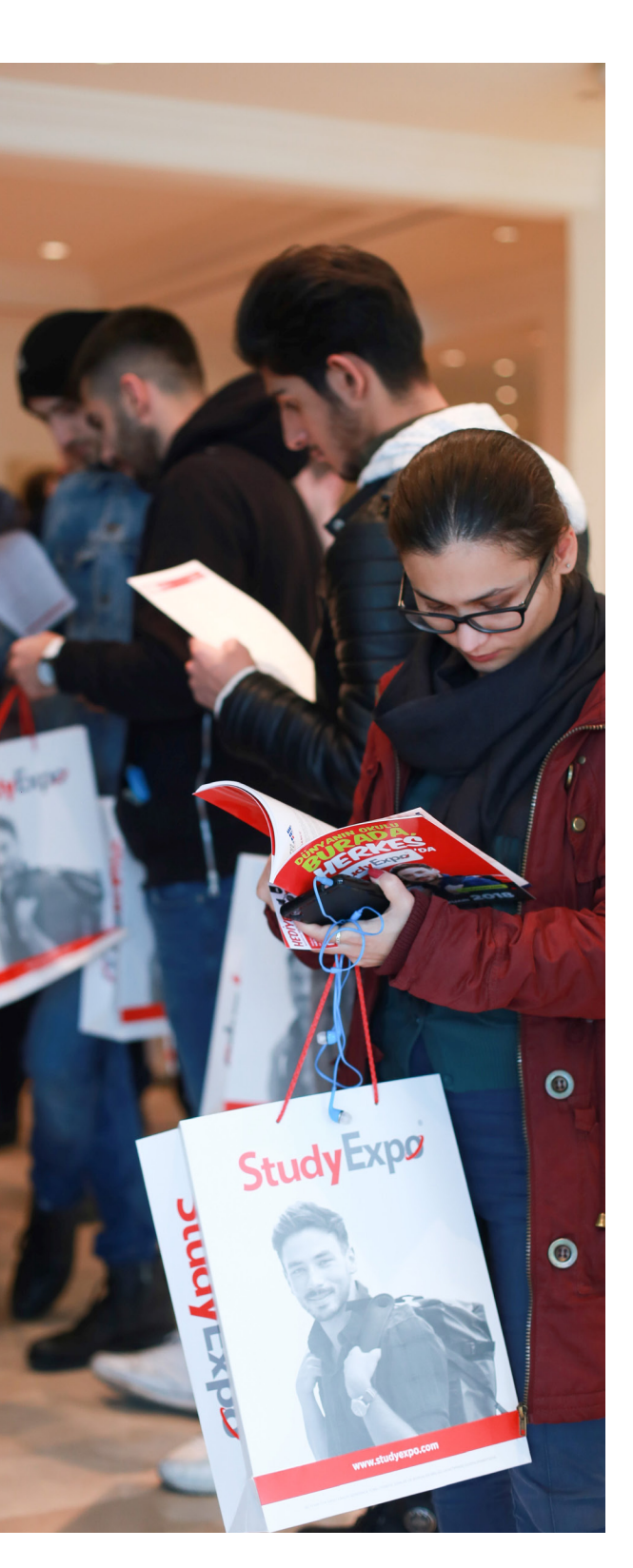
Numerous forms of mass communication