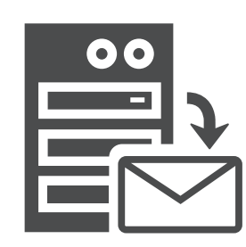
Emailing to student and school databases